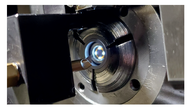
Camera in guide bushing, alignment of an internal turning tool in the clamping sleeve.