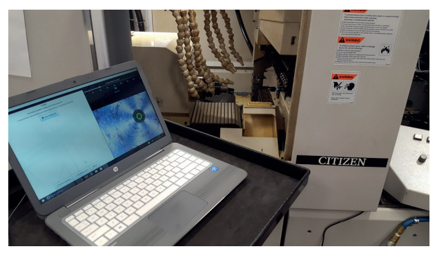
Perfect Zero aligning a micro-tool in a Citizen Swiss-Type automatic lathe.